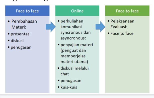
Figure 2. Model of Maharatul Qira'ah Learning Design by Using Edmodo

online lecture served as a supplement to face-to-face lectures. In this e-learning learning, the form of communication used was synchronous in discussion activities and asynchronous in working on assignments and quizzes. Take a look at the recovery design drawings below: