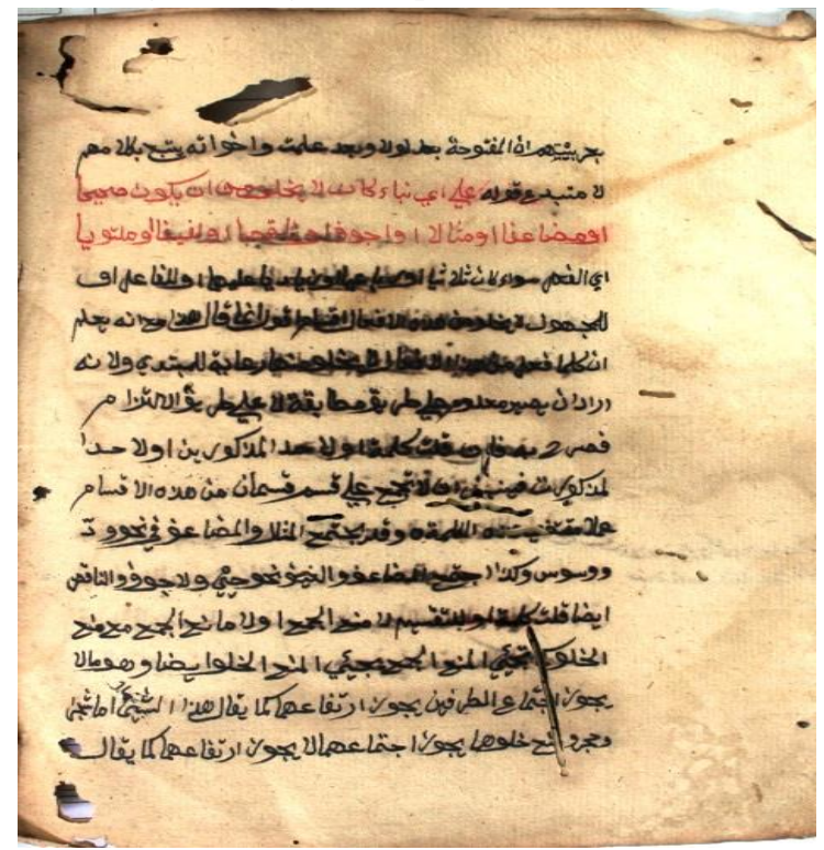
Figure 1. Page of Script no. 05/SP/SLH/2012

Know, it is found in some of these manuscripts (matn), in addition to the preface, that this book is sometimes named al-Taqrīb, and at other times it is named Ghāyat al-Ikhtishār. Therefore I also named this sharaḥ with two names, first Fatḥ al-Qarīb al-Mujīb fiy Sharḥ Alfaz al-Taqrīb, second al-Qawl al-Mukhtār fiy Sharḥ Ghāyat al-Ikhtishār.