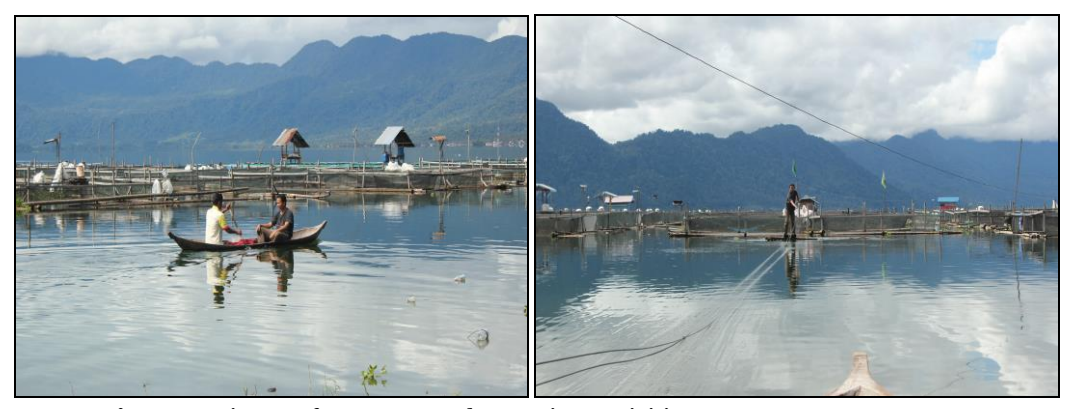
Figure 2. Picture of Some Karamba Tourism Activities

Karamba is part of cultural tourism potential as well as natural tourism. Culture in this case refers to the definition proposed by Edward B. Taylor which consists of knowledge, belief, art, moral, law, custom and capability and other habits as members of