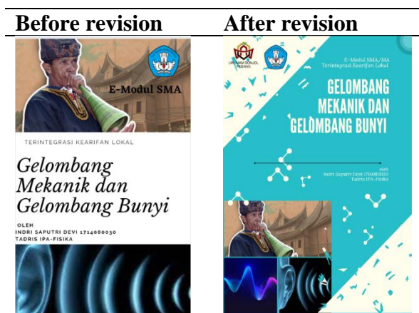
Figure 3. View of E-module before and after revision

Four, Implementation, After the validation stage, this product was revised and then tested to determine the level of practicality. After the practical test was carried out on the implementation of the E-Module to identify the critical and creative thinking of students at SMA Kartika 1 – 5 Padang.