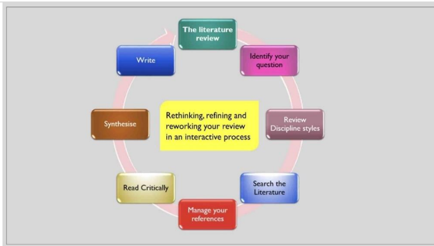
Figure 1. Literature Review Method Process